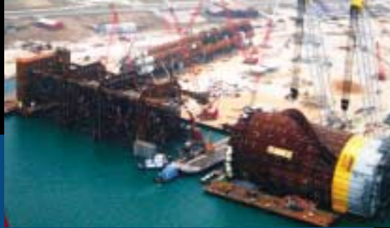
BP Holstein Truss Spar, Technip – Galvotec III anodes.