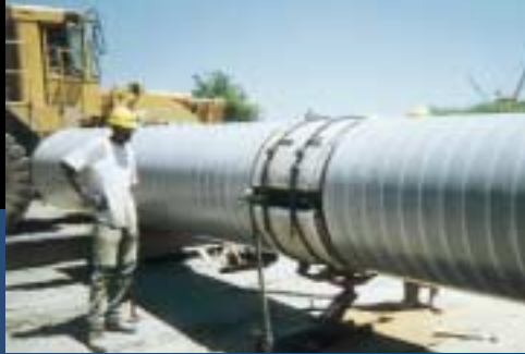
AMOCO Trinidad - 1200 lb. 40" diameter Galvotec III bracelet anodes.