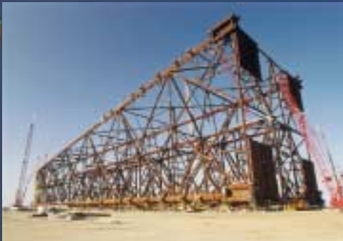
ELF Exploration -Virgo Platform, 905 lb. Galvotec III aluminum platform anodes. "Engineering Services Provided by Enercon"