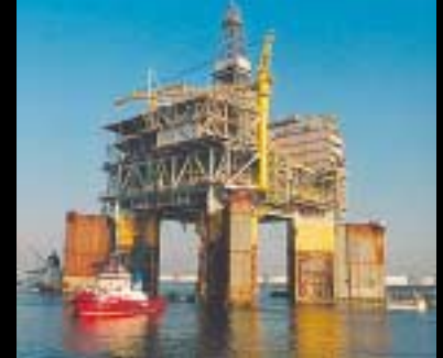
EXXONMOBIL Kizomba A Extended Leg Platform - Utilizes Galvotec III sacrificial anodes as an integral part of its CP System.