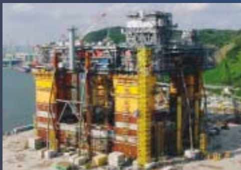
SHELL Nakika Platform and Pipelines – Galvotec III and Galvotec CW-III anodes.