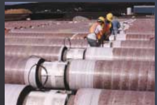
SABLE Offshore Energy Project, Nova Scotia, Canada - 26" diameter Galvotec III bracelet anodes. Storage Yard - Shaw & Shaw - Sheet Harbour - 9/17/98