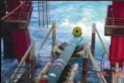
Cameron Highway Oil Pipeline System, El Paso Manta Ray Gathering Co., Galvotec III 30" diameter bracelet anodes.