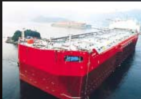
SHELL Bonga FPSO, Samsung - Galvotec III and Galvotec zinc hull and tank anodes.